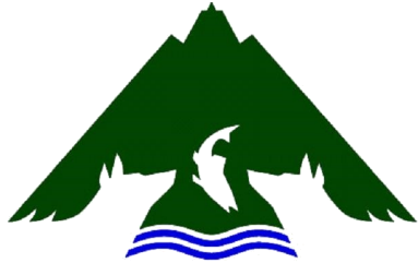
Alberta Conservation Association

Listed below are corporate partners who's sponsorship aids us in realizing our endeavours: